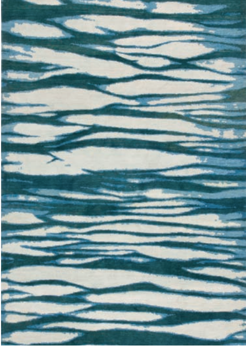
SG-01 Wind in the Pines

Distinctive Rugs & Treasures of the Silk Road