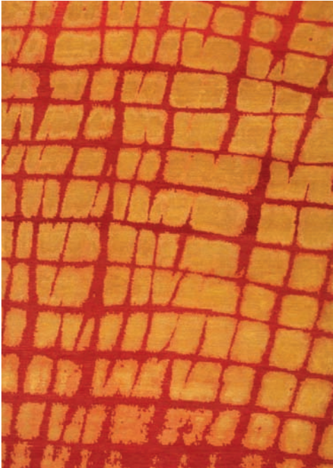
SG-05 Wind Driven Rain Red

Distinctive Rugs & Treasures of the Silk Road