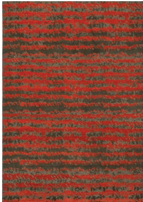
SG-04 Field Red