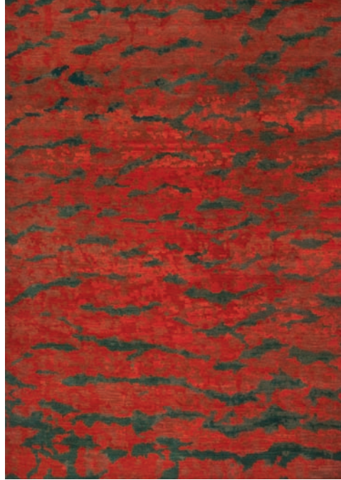
SG-02 Wood Grain